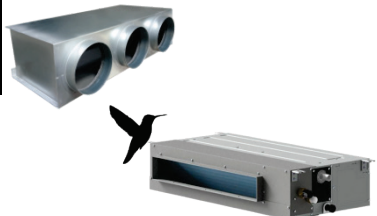
IG ... BP - NG - THERMOR BASSE PRESSION